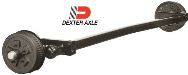
DEXTER TORFLEX AXLE