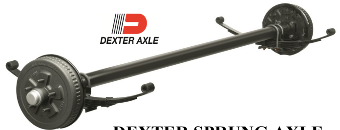
DEXTER SPRUNG AXLE