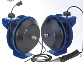
EZ-PC13 & PC13 Series