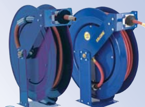
EZ-T & T Series