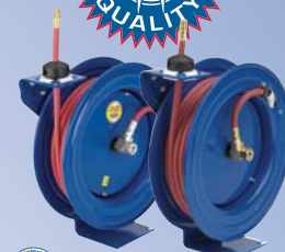
EZ-P & P Series