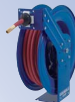
EZ-SH & SH Series